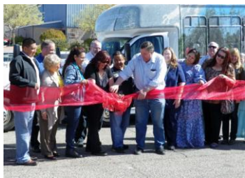
YAT Ribbon Cutting