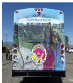
YAT Route Bus